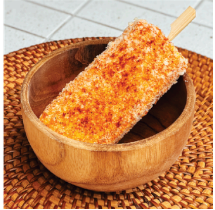
MEXICAN 'ELOTES' STREET CORN