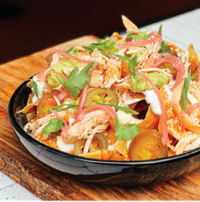
NOT YOUR AVERAGE NACHOS