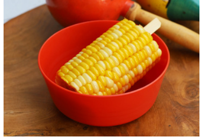
Corn on the Cob