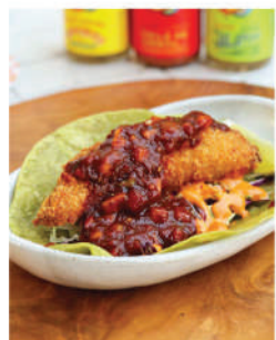
BAJA FISH TACO