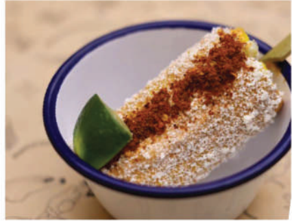
MEXICAN 'ELOTES' STREET CORN