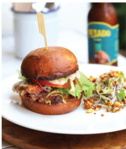
GRILLED MARINATED CHICKEN THIGH

smoked sliced beef brisket, chipotle bbq, secret sauce slaw, pickled jalapeño and onion, sliced cheese