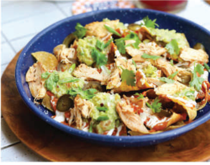
NOT YOUR AVERAGE NACHOS