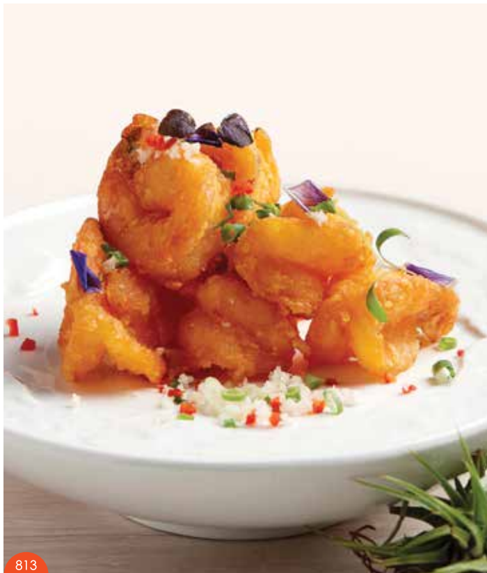
813 椒盐虾球 Shelled Prawns Stir-fried with Pepper and Spiced Salt $ 26 小/S | $ 39 中/M | $ 52 大/L