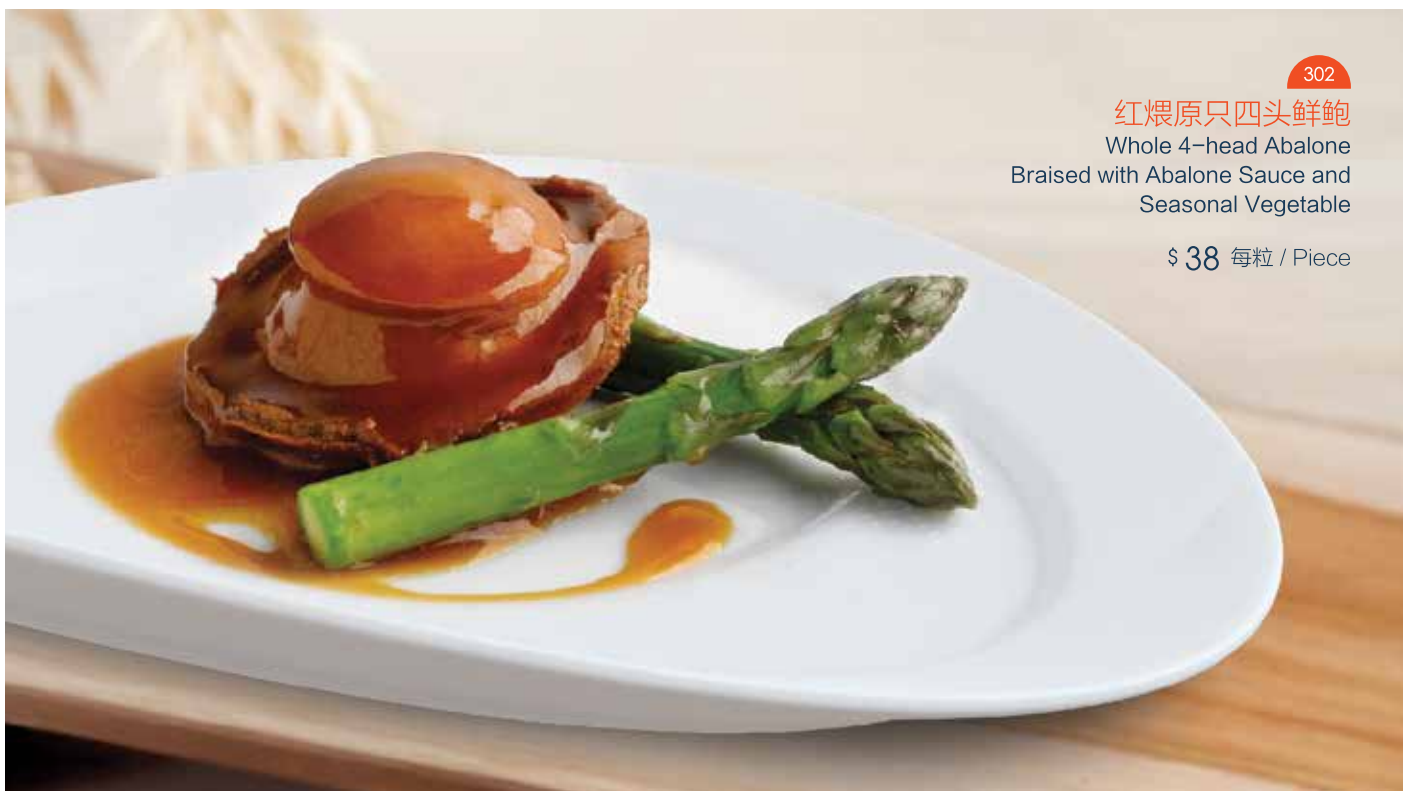
302 红煨原只四头鲜鲍 Whole 4-head Abalone Braised with Abalone Sauce and Seasonal Vegetable $ 38 每粒 / Piece