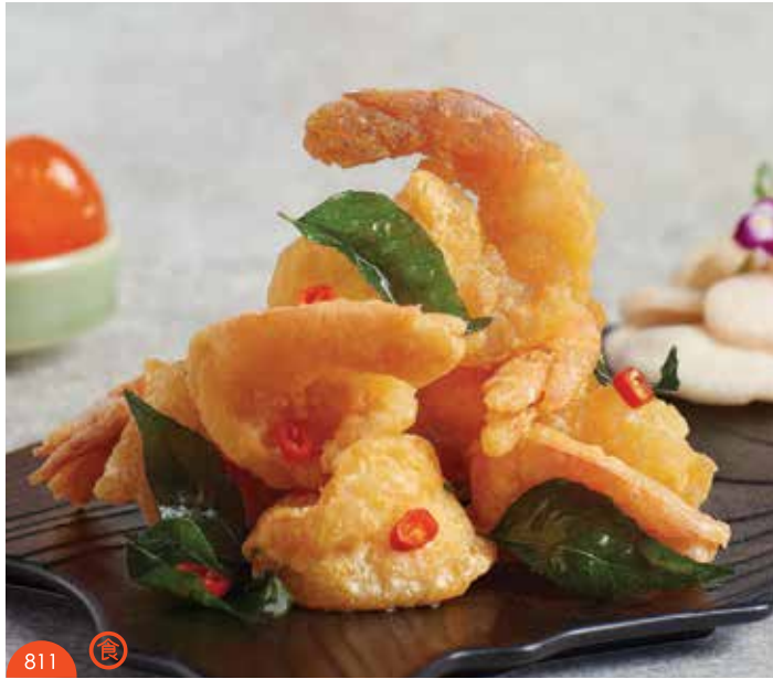
811 咸蛋金沙虾球 Shelled Prawns Stir-fried with Golden Salted Egg $ 26 小/S | $ 39 中/M | $ 52 大/L