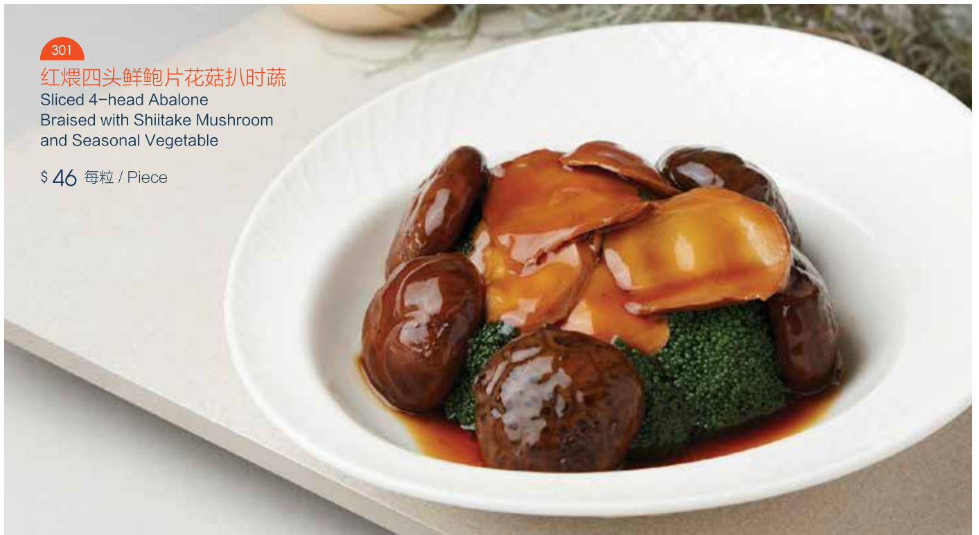
301 红煨四头鲜鲍片花菇扒时蔬 Sliced 4-head Abalone Braised with Shiitake Mushroom and Seasonal Vegetable $ 46 每粒 / Piece