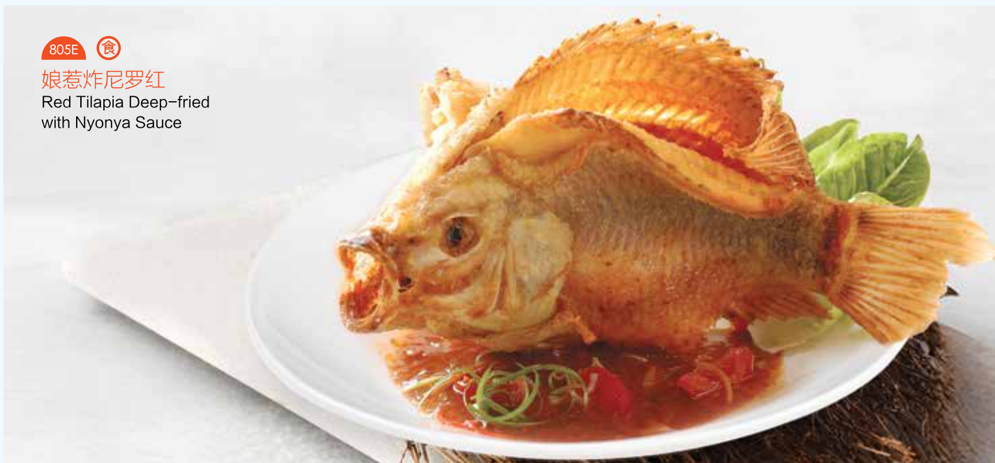
娘惹炸尼罗红 Red Tilapia Deep-fried with Nyonya Sauce