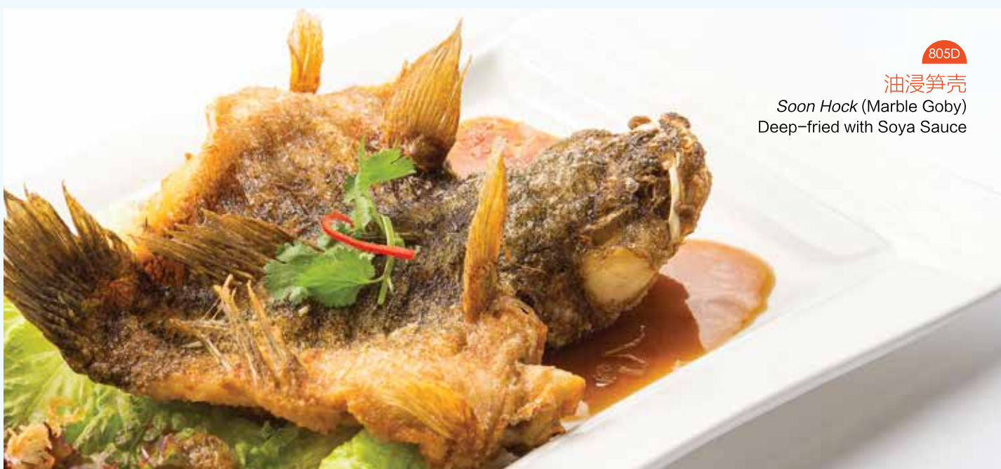
油浸笋壳 Soon Hock (Marble Goby) Deep-fried with Soya Sauce