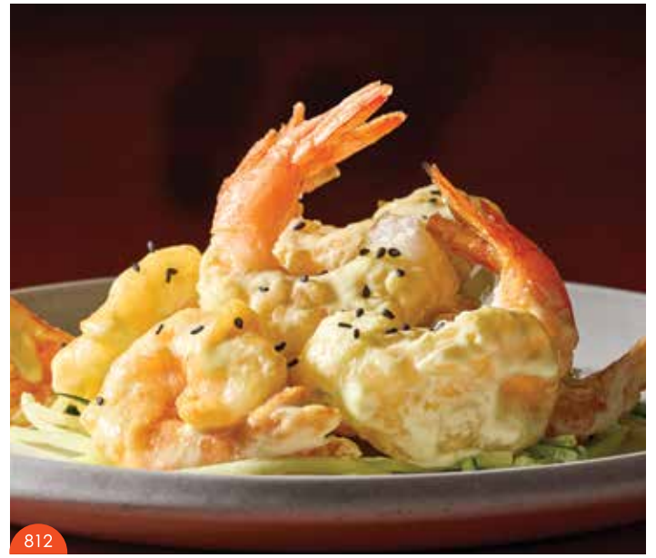
812 芥末沙律虾球 Deep-fried Shelled Prawns with Wasabi-Mayo $ 26 小/S | $ 39 中/M | $ 52 大/L