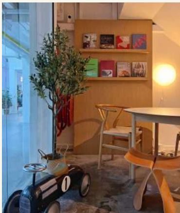
4 EVERTON PARK #01-42 Tel : +65 83080103