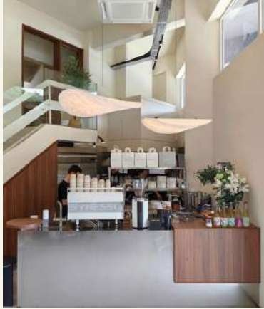
551 BUKIT TIMAH ROAD Tel : +65 85121355