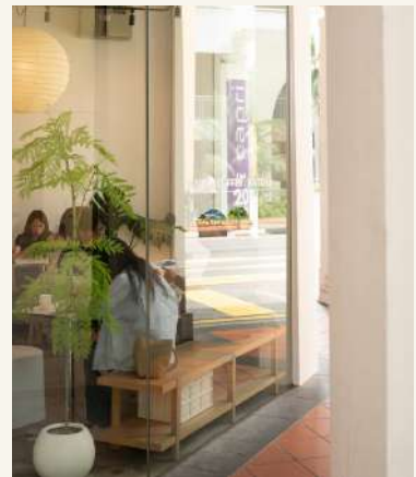
22 CROSS STREET #01-63