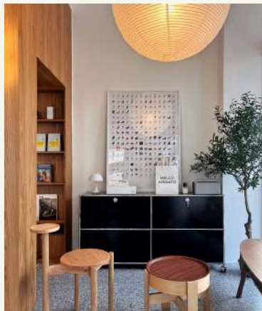
58 SENG POH ROAD #01-15 Tel : +65 80272558