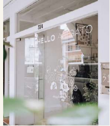
314 JOO CHIAT ROAD Tel : +65 88895657