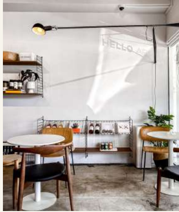
227 UPPER THOMSON ROAD Tel : +65 87723778