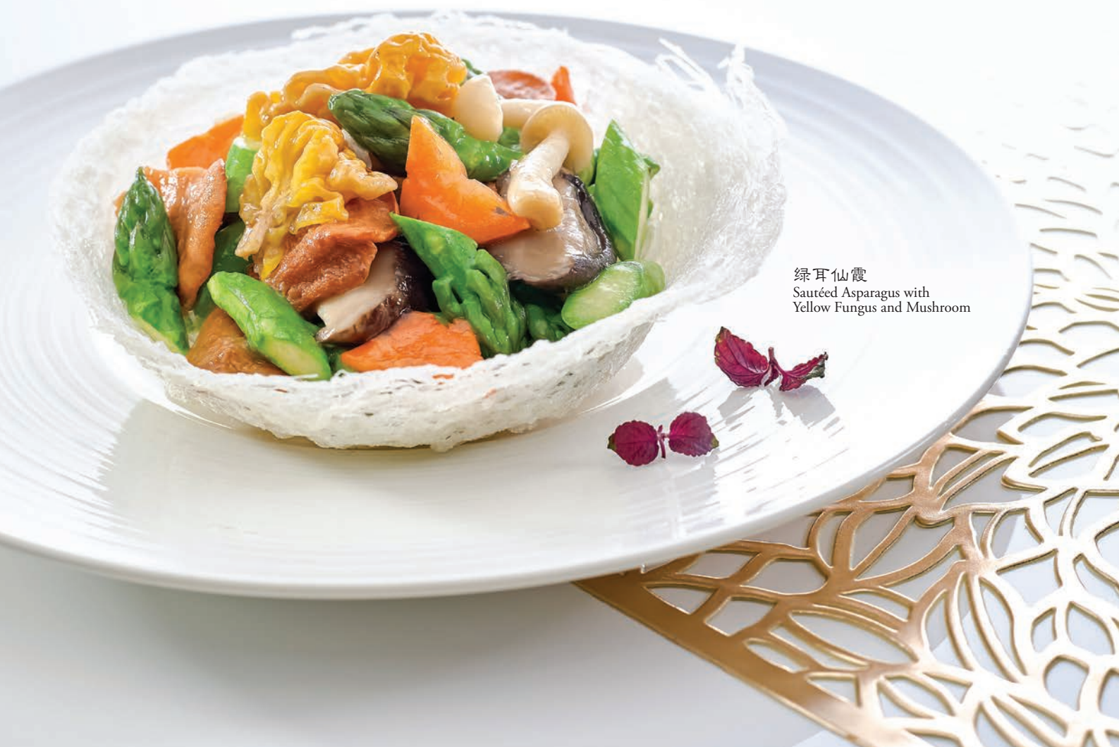
绿耳仙霞 Sautéed Asparagus with Yellow Fungus and Mushroom