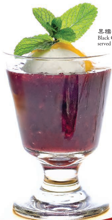
黑糯米雪糕 Black Glutinous Rice served with Ice Cream