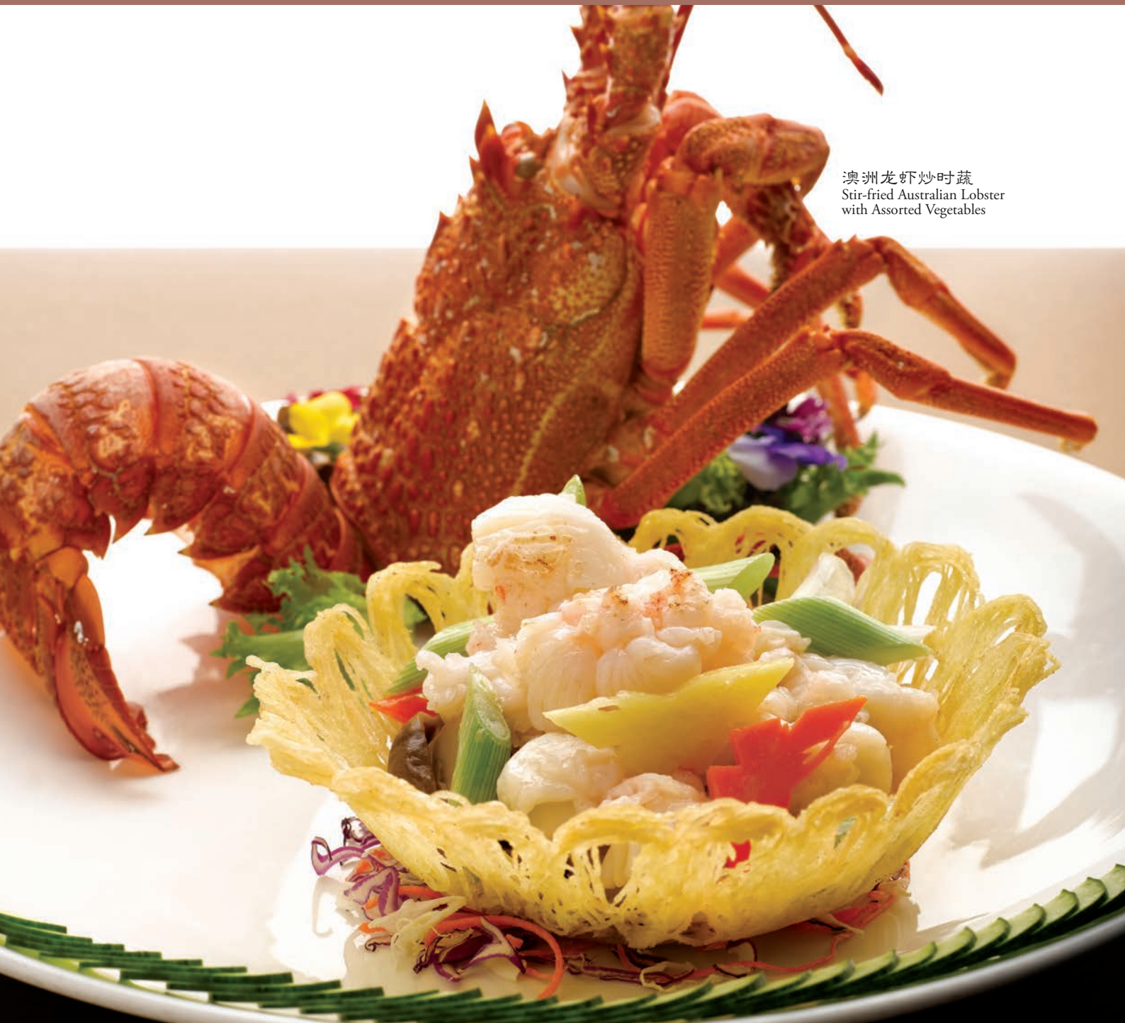
澳洲龙虾炒时蔬 Stir-fried Australian Lobster with Assorted Vegetables