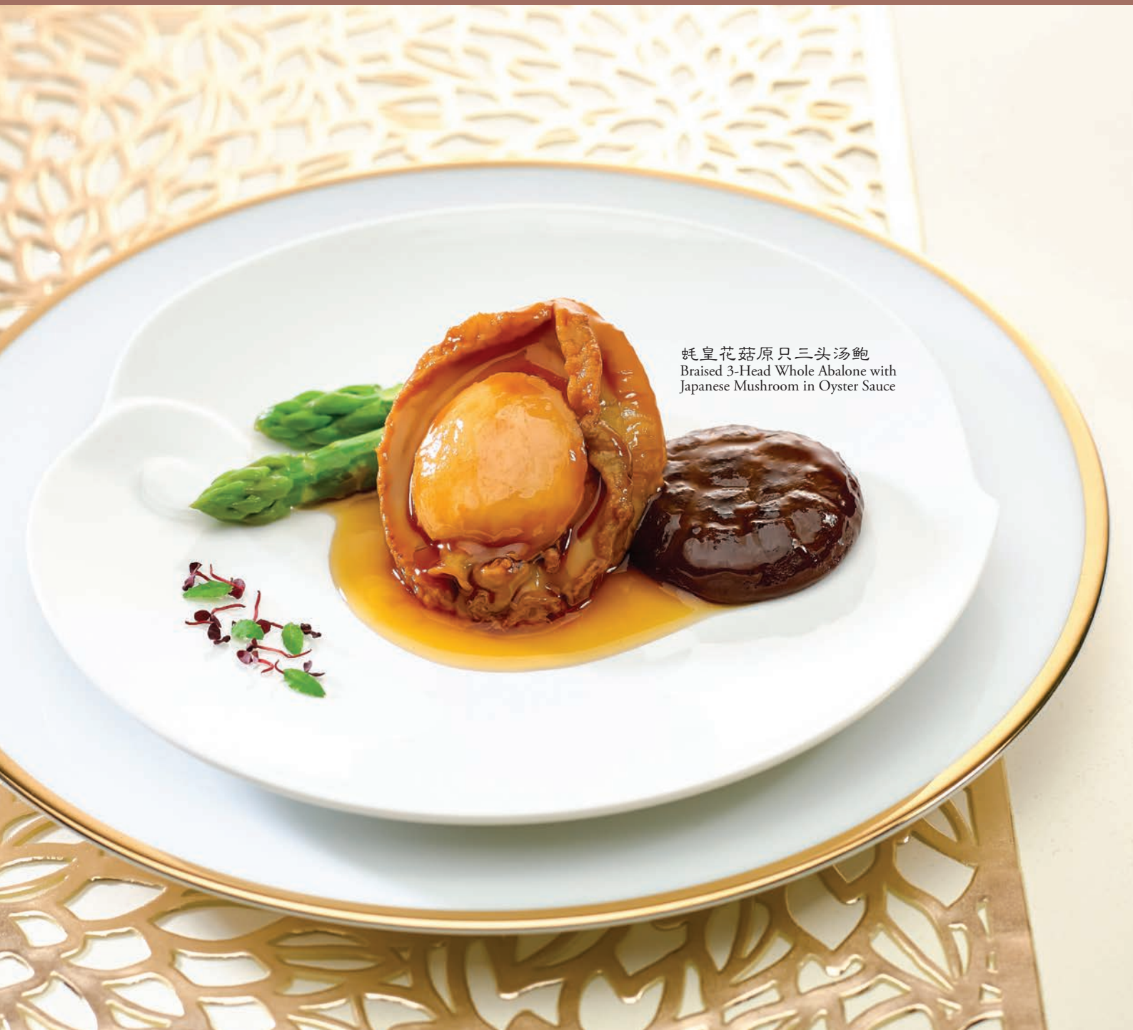
蚝皇花菇原只三头汤鲍 Braised 3-Head Whole Abalone with Japanese Mushroom in Oyster Sauce