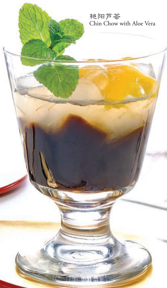
艳阳芦荟 Chin Chow with Aloe Vera